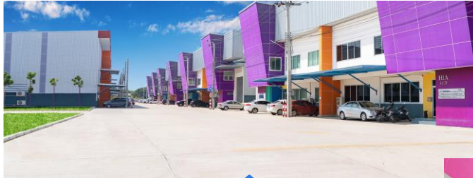
CHODTHANAWAT 2 BANGNA KM.16

“ Develop and Enhance to International Standard “